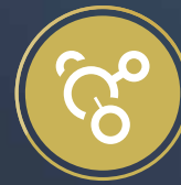
CUT RESISTANCE COMPOUND