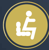
EXCELLENT RIDE COMFORT