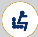
EXCELLENT RIDE COMFORT